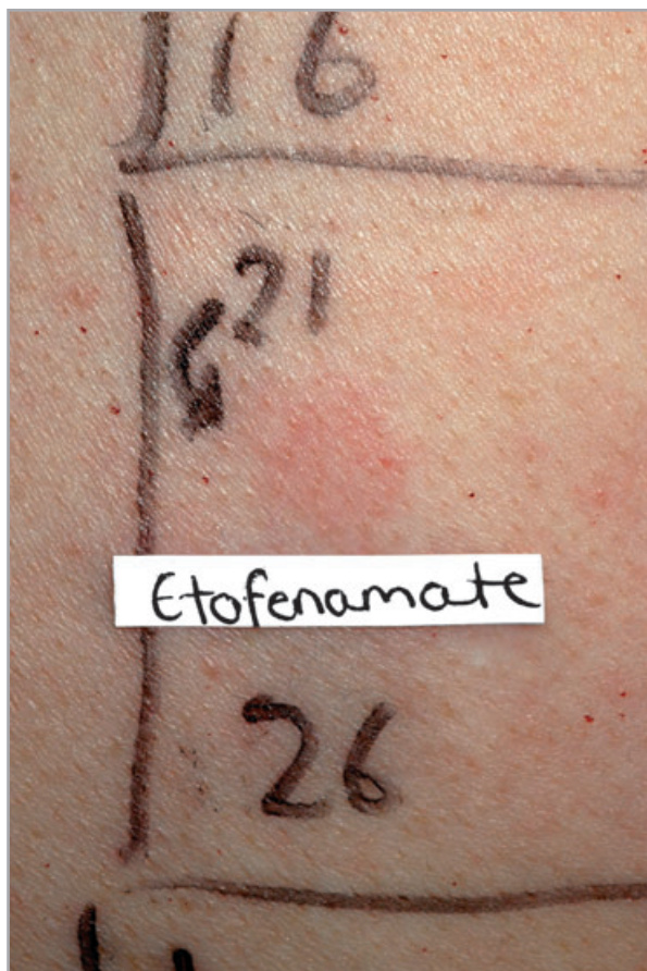
Fig 2. Close-up of etofenamate reaction at 24 h post irradiation in irradiated set, displaying '+' International Contact Dermatitis Research Group grade reaction.

The UV absorbers most commonly leading to PACD were octocrylene and benzophenone-3. As discussed above, many subjects may have developed cross-reactions to ketoprofen. However, they appear to have an inherent photoallergenic po-